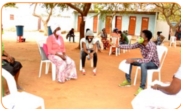
Mosaiko TFT implementation workshop during COVID-19, in August in Luanda, Angola.