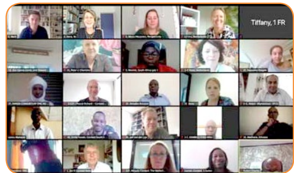
TFT and Cordaid partnership held from 31 August - 04 September on the strategy of Development on Southern fragile countries.