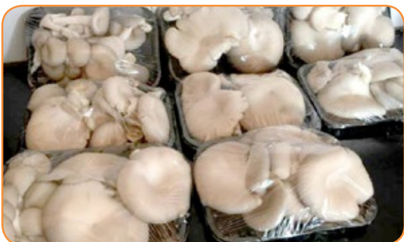
Caroline Mutimbanyoka from Zimbabwe urban vegetable farming project that reaches 265 beneficiaries.